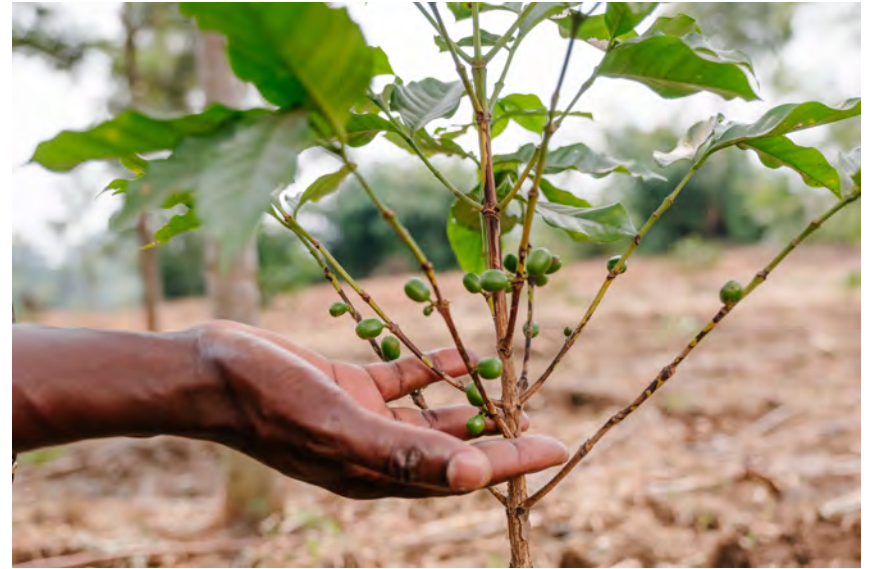
Reforestation: raising awareness of the environment, Democratic Republic of Congo

Louvain Coopération The Mangrove Foundation