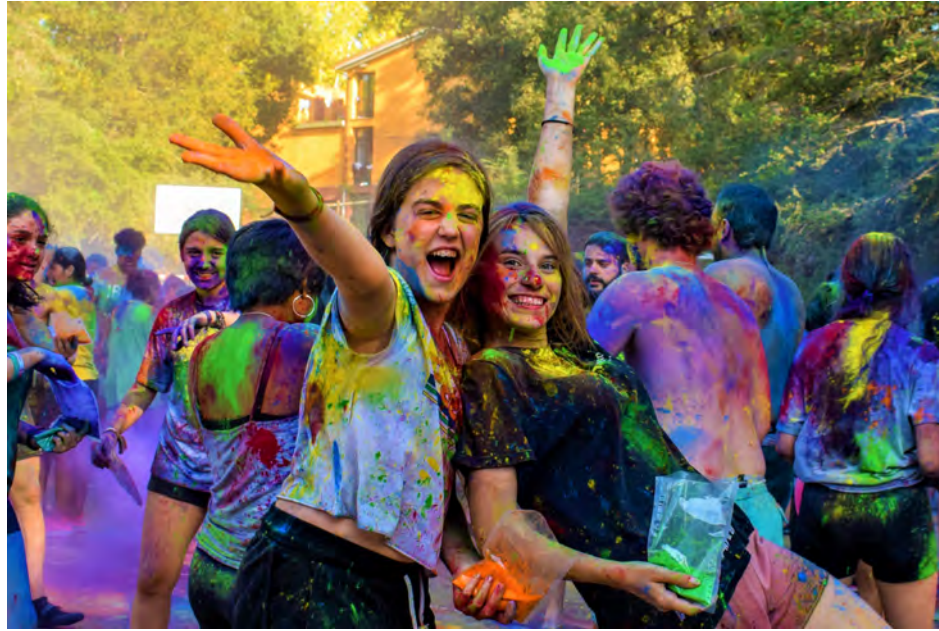
Enjoying the color at a youth programme, Spain

Fundación Young Life The Covenant Foundation