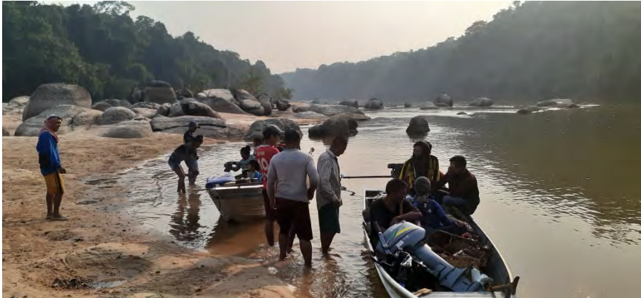
Indigenous men delivering emergency supplies in the Amazonas, Brazil

Casa Social-Environmental Fund Wild Flowers Foundation