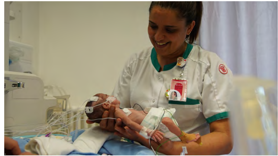
Pediatric Intensive Care Unit, Bethlehem, West Bank

Warriors Against Cancer Fondation Alijul