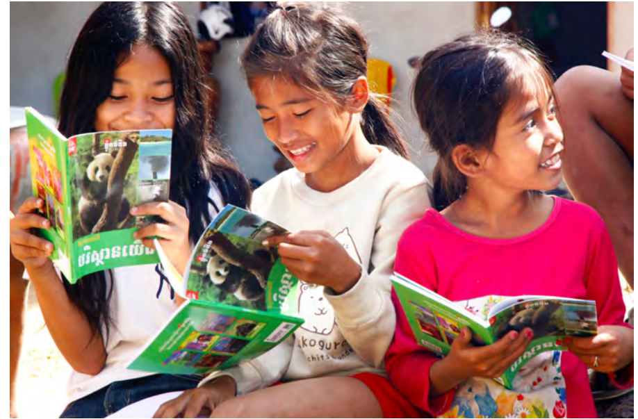
Bibliobus: Raising awareness for the environment, Cambodia

Handicap International Fondation Liberté