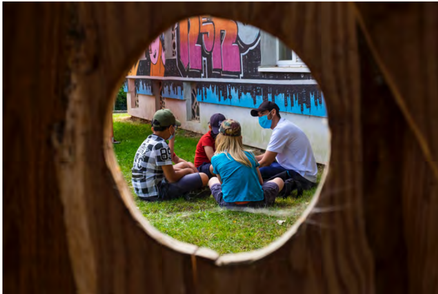
Summer workshop in pandemic times, Esch-sur-Alzette, Luxembourg