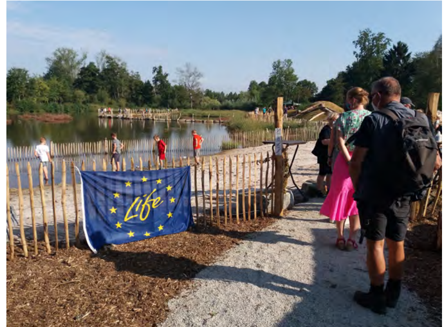
Spawning grounds and nature experience in the Grote Netewoud, Belgium

Casa Social-Environmental Fund Wild Flowers Foundation