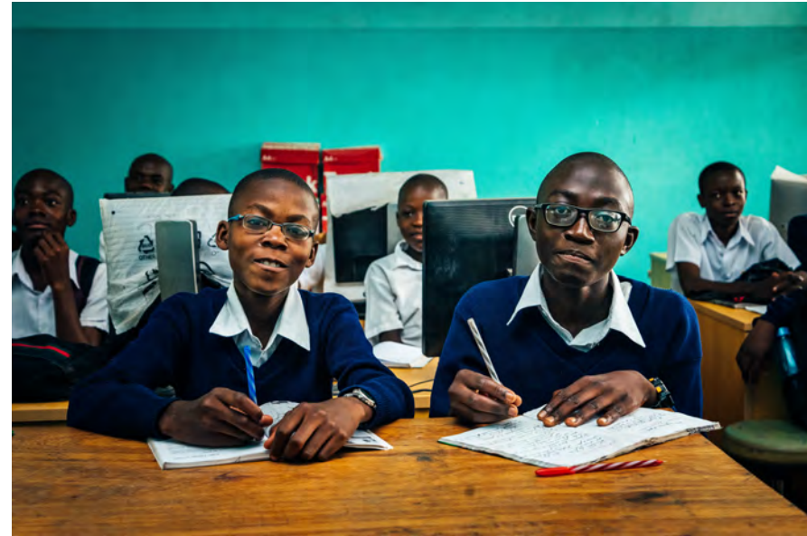
Students at Saint Boniface college, Inclusive Education for visually-impaired children, Lubumbashi, Democratic Republic of Congo

Luxembourg Air Rescue a.s.b.l. Fondation COVID-19