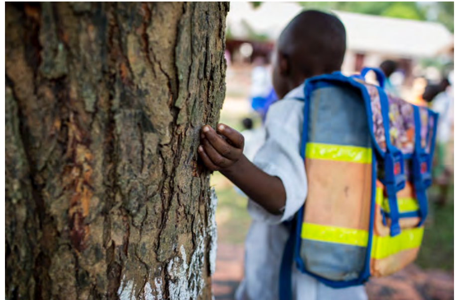
Ecole Kokoro II, Bangui, Central African Republic

SOS Villages D'Enfants Monde ATOZ Foundation