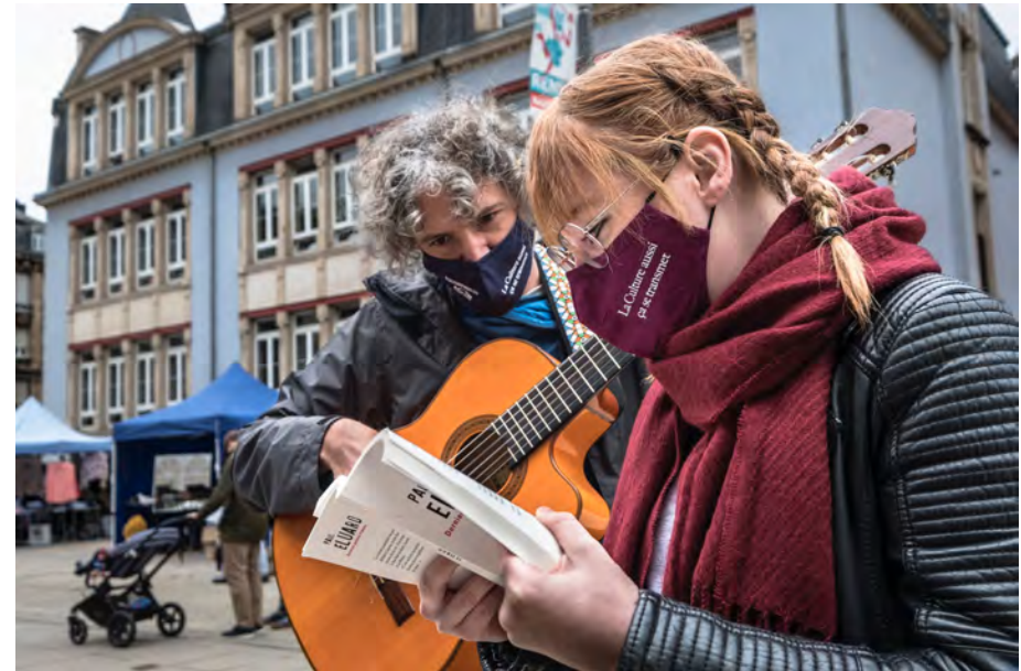
“Rentrée Culturelle” in Esch sur Alzette, Luxembourg

Kulturpass/Cultur'all asbl Fondation Enovos