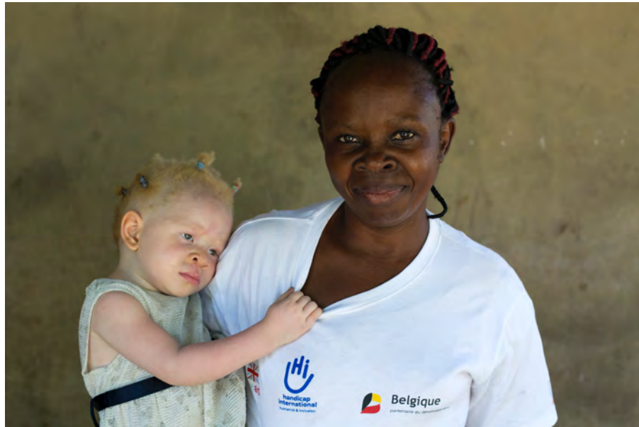
Supporting mother and children's healthcare, Democratic Republic of Congo

Handicap International Fondation Jos et Mimieke