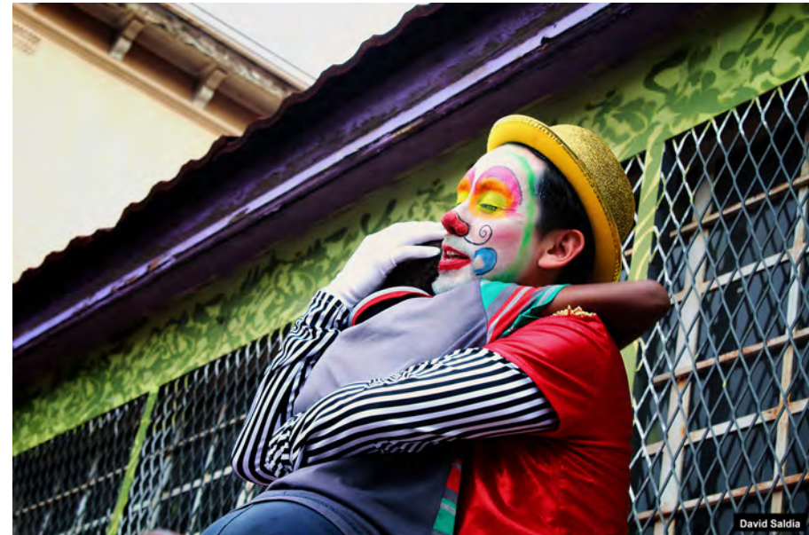
Hug from afar – Chilean outreach team, South Africa

Handicap International Fondation Jos et Mimieke