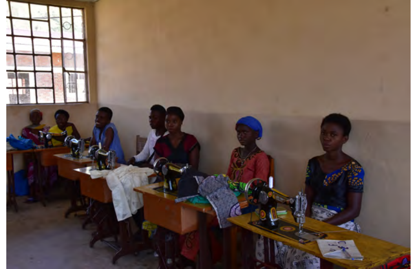
Education for all: Access to school and professional training for children and teens, Democratic Republic of Congo