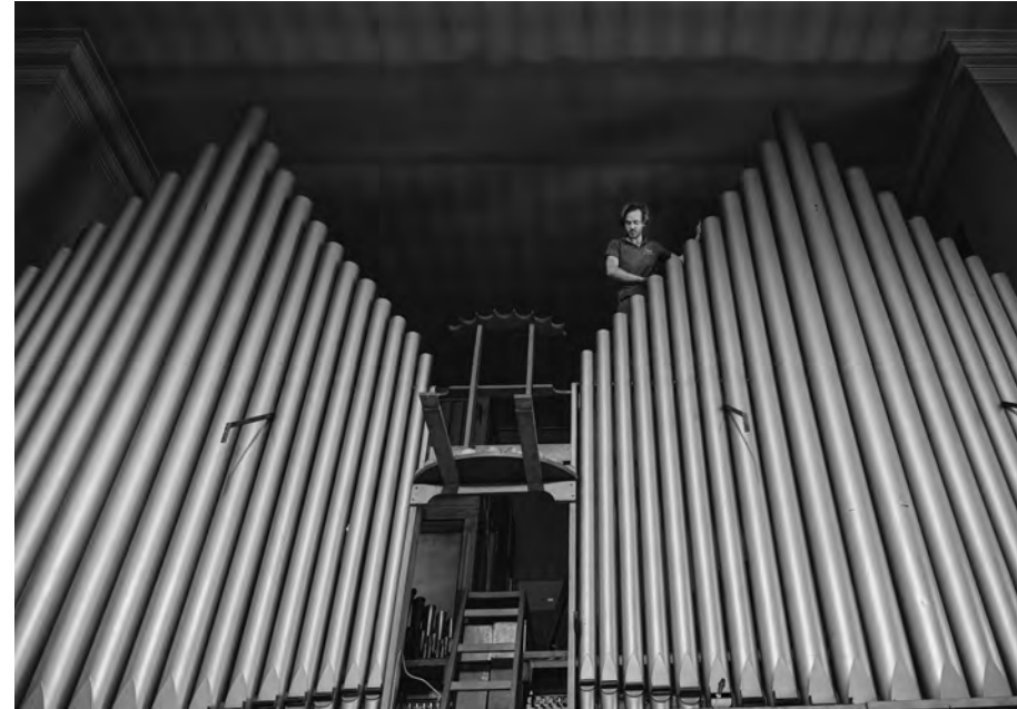
Reaching great heights: restoring the main organ at the Notre Dame de Luxembourg cathedral

La Main Tendue Asbl Angela Fondation Marienburg