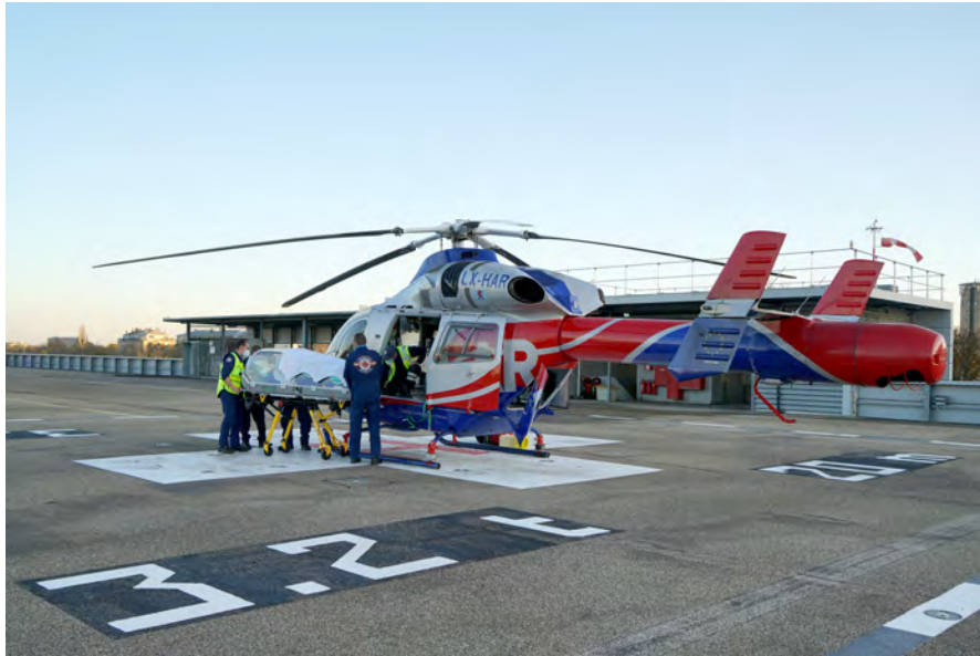
EpiShuttle for highly infectious patient transport, Luxembourg

Luxembourg Air Rescue a.s.b.l. Fondation COVID-19