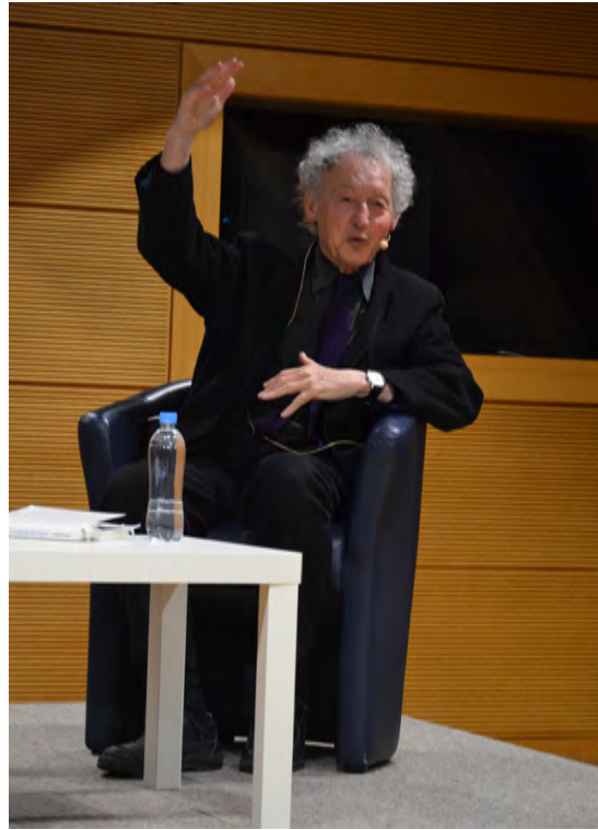
French historian Pierre Birnbaum speaking at the conference «La leçon de Vichy. Une histoire personnelle», Luxembourg

Institut Pierre Werner Fondation Candida