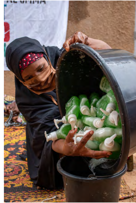
Women producing masks and soap to protect community members from the virus, Niger

CARE in Luxembourg a.s.b.l. Stiftung Pflanzen für Menschen