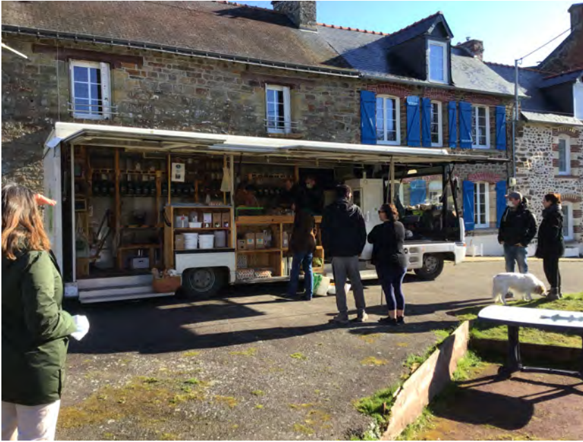
The «car à vrac» (bulk wagon) an itinerant community grocery store, France