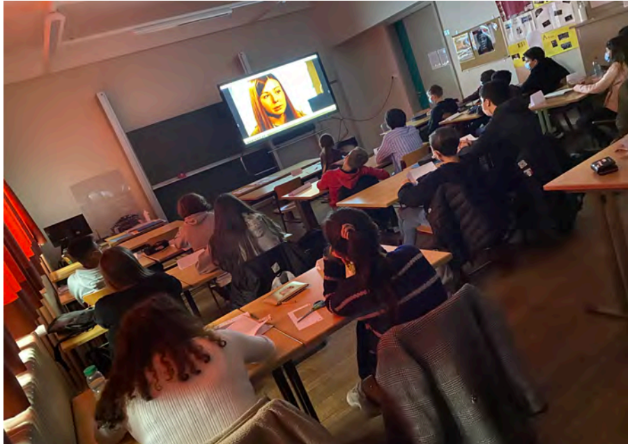
Group sessions and workshops: Bullying, Cyber-bullying, and the lockdown, Luxembourg

La Main Tendue Asbl Angela Fondation Marienburg