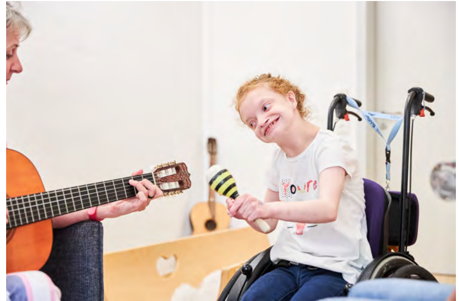
Music connects, Germany

Chiens guides d'Aveugles au Luxembourg Fondation Josée Wolter-Hirtt