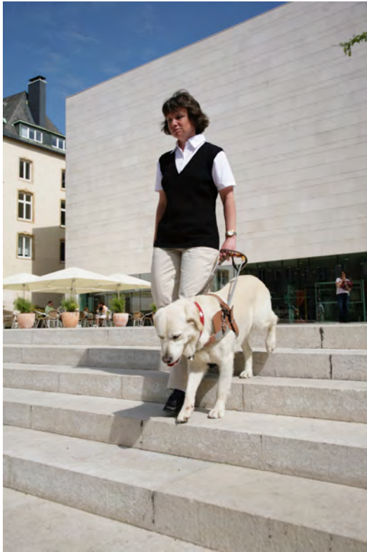
Everyday life with a guide dog, Luxembourg

Chiens guides d'Aveugles au Luxembourg Fondation Josée Wolter-Hirtt