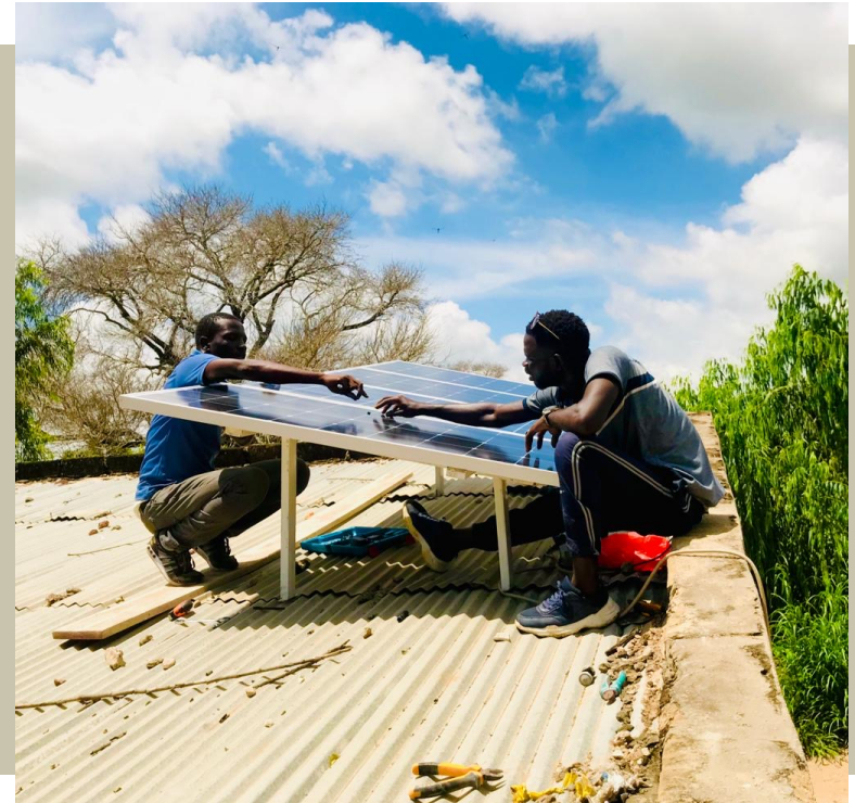
Brightening up schools with the help of solar energy in Tivaouane, Senegal.

Aide à l'Enfance de l'Inde et du Népal Fondation Mosaïque