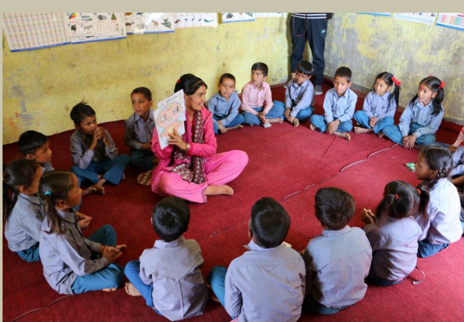
Attentive students: Reinforcing quality childhood education in Dailekh district, Nepal.

Aide à l'Enfance de l'Inde et du Népal Fondation Mosaïque