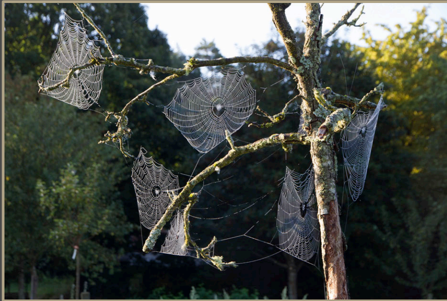
“rencontre à l’aube”

Support for the cooperative, formed in March 2014 and situated in an orchard in Eicherfeld near Luxembourg city, with the objective of a transition and education for a resilient and regenerative agriculture