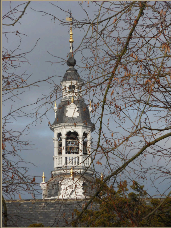
“Abbaye de Postel”

Conservation of the monastery Abbey de Postel in Flanders