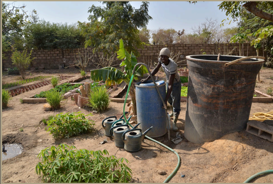
“centre agricole Tond Tenga”

Support for the training of agents at the agricultural center for an ecological environment and the development of agricultural cooperatives