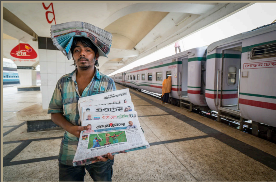
“Newspapers” Support for an adult literacy program