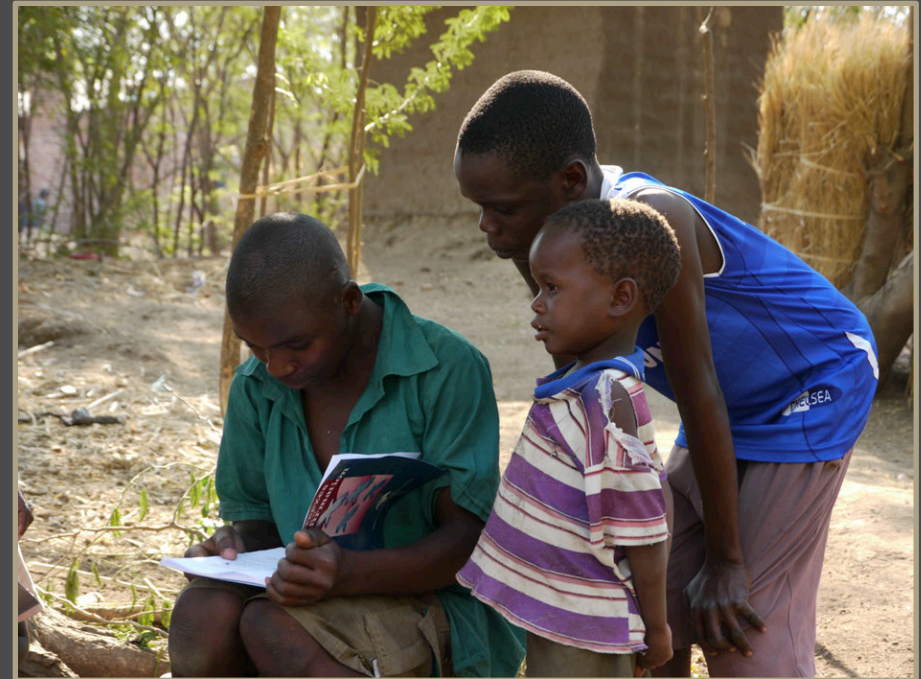
“Motivated to advance in the studies” Support for the training of teachers and the promotion of schools in Malawi