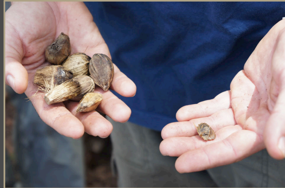
“graines de vacoas”

Supporting voluntary commitment to nature. Seeds of vacoas are planted by volunteers of the Association Nature Océan in order to recreate natural habitat at Geck vert of Manapany