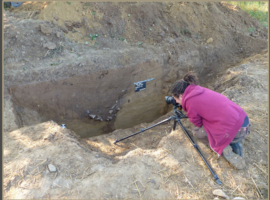
“Defense ditch of a roman legionary camp”

Archaeological exploration of the lower Lahntal as a connecting axis between the Roman Empire and the ancient Germans